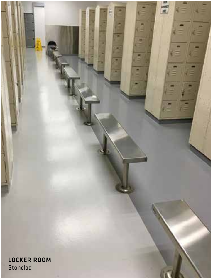
LOCKER ROOM Stonclad

Chemical resistant flooring is designed to stand up to a wide range of harsh chemicals over long periods of time. This type of flooring is one whose functional and aesthetic performance won't degrade with repeated chemical spills or the use of industrial-grade cleaning agents. This allows you to keep important areas 100% sanitary at all times without having to worry about the longevity of your surfaces. They are specifically designed for chemically intensive pharmaceutical environments.