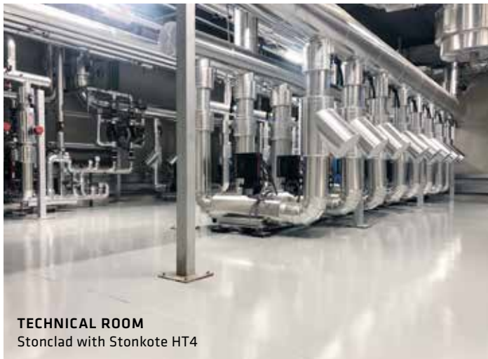
TECHNICAL ROOM Stonclad with Stonkote HT4