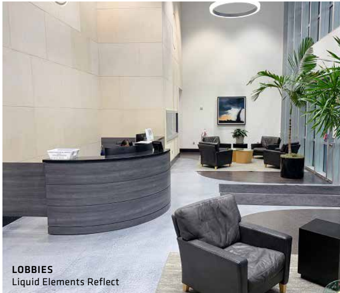
LOBBIES Liquid Elements Reflect