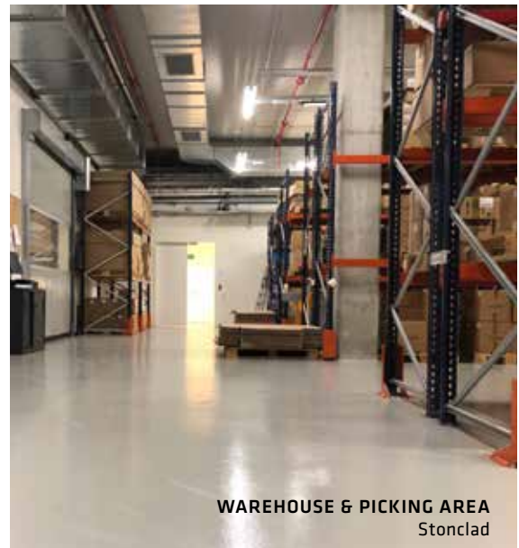
WAREHOUSE & PICKING AREA Stonclad

We take responsibility for products and workmanship bringing you a highly personalized approach to products and services. Our sales experts work with you directly and bring the additional resources of Stonhard's construction management team, installation crews, and architectural and engineering group. Real-time problem solving and installation experience, there's no problem we cannot solve.