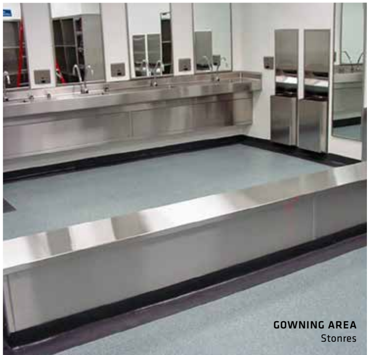
GOWNING AREA Stonres