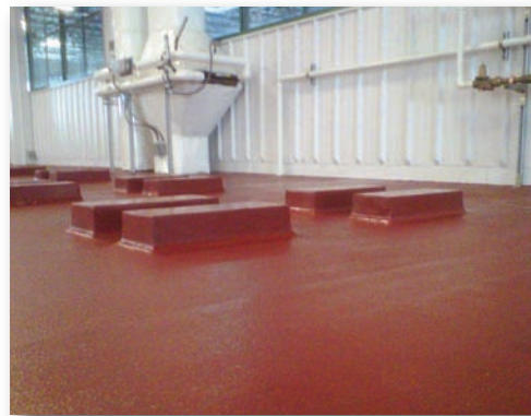
Stonhard used Stonclad UT mortar and Stonset TG6 grout to build custom pads for equipment at Shearer's Massillon, OH production facility.

Stonhard recommended Stonblend GSI-G for the offices, labs, locker rooms and break rooms at Shearer's. Stonblend GSI-G is a long-wearing, stain resistant, decorative floor system that incorporates recycled glass chips into its composition. Because it uses recycled materials, Stonblend GSI-G contributes to LEED points. Additional LEED points could