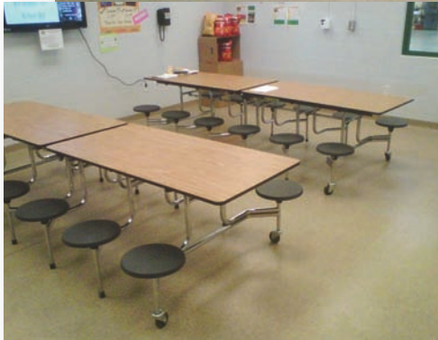
Stonhard's Stonblend GSI-G system incorporates recycled glass into its composition and provides a durable, easy to clean, decorative floor for offices, labs, locker rooms and break rooms at Shearer's.

Shearer's is extremely happy with the results of their new Stonhard floors. Management at the Massillon plant reports that the floors have withstood construction traffic, along with operations traffic, and is in excellent condition. The company is confident that the floors will continue to live up to their expectations and is considering standardizing all of their facilities with Stonhard products, relying on Stonhard's single-source warranty to guarantee the satisfaction of their floors, whether they're in an office in Ohio or in a production plant in Texas. Stonhard plans to complete work in the Hermiston, OR Shearer's facility in 2011.